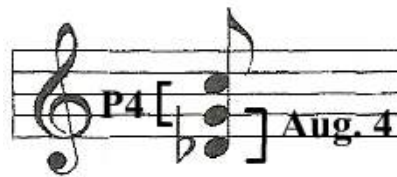
Figure 2. Viennese Trichord.