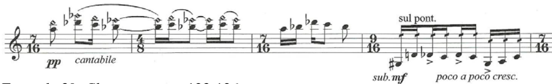
Example 39. Cleopatra , mm. 123-126.

The sixteenth-note tremolo played ponticello in mm. 125-134 contrasts the previous cantabile melody and acts like a bridge that leads to the final part of the fourth section. The tremolos repeat the motive of mm. 125-126 four times getting gradually louder and moving into a higher register to build suspense and agitation. The final repetition deviates from the motive at the end. The section reaches its peak at the tremolo E-flat octaves marked triple forte , ending with a double sforzando ( sffz ) E-flat at mm. 133-135.