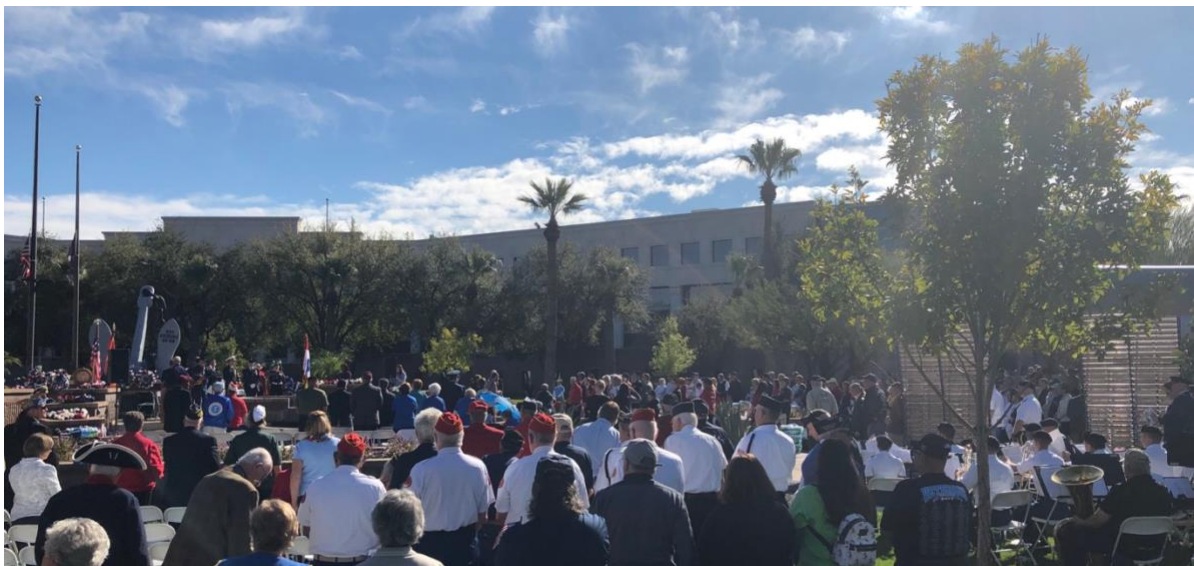
Figure 3: The 2018 Pearl Harbor Remembrance Day Ceremony. The anchor is on the left and the gun barrels and WWII memorial are on the right. December 7th, 2018.