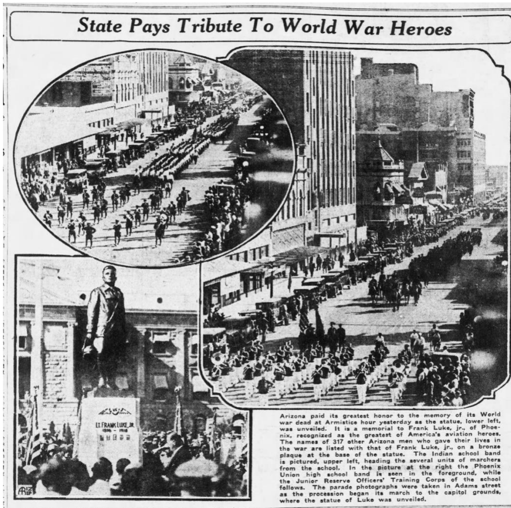
Figure 1: Frank Luke Memorial Dedication Newspaper Clipping, "State Pays Tribute to World War Heroes," Arizona Republic, November 12, 1930

In his dedicatory speech, Governor Phillips spoke of the example of Frank Luke and his impact on the state of Arizona. "Lieut. Frank Luke Jr. brought to our state and to the nation distinction and honor," the governor stated, "we are proud to honor the memory of our native son by the erection of this monument which is built to endure. It will stand as an inspiration to the youth of today and tomorrow. The example of courage and patriotism set by this Phoenix boy should encourage them to do their best in every important undertaking of their lives so that when the big moment comes they may be prepared, as he was, to give their best for whatever worthy purpose it may be