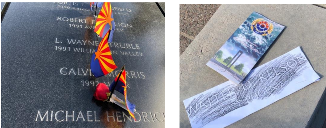
Figure 7: Mementos at a Memorial: Rose left by a name and a rubbing taken from the Arizona Fallen Firefighter Memorial.

This is very much a living memorial, where wreaths, flags, and other mementos are often left at this as well as at the Peace Officers Memorial. The names etched into the granite function as an almost second grave marker, and as a result, visitors bring things to leave at the space marking their loved one’s name just as they would to a gravesite in a cemetery. At the 2019 annual ceremony in January, a family took a picture next to the name of their husband and father, a Phoenix firefighter who lost his life in 1977. Having traveled all the way from Ohio to attend this yearly ceremony, one daughter made a rubbing of her father’s name to take with her as a memento. Another woman stood over a name of a loved one for quite some time, just gently touching it before leaving a rose in a glass case next to it. 134 The poignant and raw emotions I saw on the faces of family members attending this ceremony are evidence of the memorial’s power to provide a place of remembrance and healing for the loved ones of these fallen firefighters. The