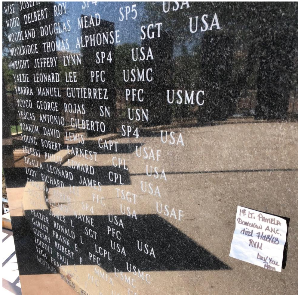
Figure 4: A note left on a pillar of the Arizona Vietnam Veterans Memorial.