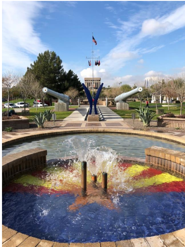
Figure 2: View of the Wesley Bolin Memorial Plaza from the anchor of the USS Arizona looking through the plaza and toward the State Capitol Building.

inspiration to all citizens for greater patriotism, loyalty, and devotion to our country and to protect, foster, and serve its lofty ideals.” 81