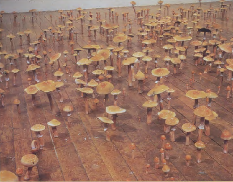
Roxy Paine, 1997 Psilocybe cubensis Field (detail) polymer, lacquer and oil paint