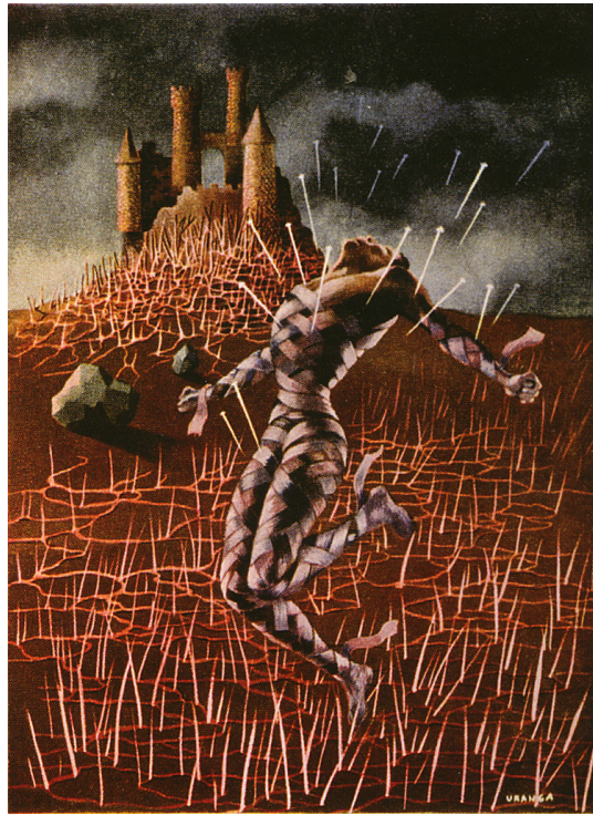
Fig. 2. Remedios Varo, Rheumatic Pain II , ca. 1948-49

fully bandaged body, arched in excruciating pain, hovers in the foreground of a barren, thorn-filled landscape. Huge needle-like nails rain down on the lonely figure, puncturing the body; a medieval castle, beckoning respite, rises from a mound in the distant thorny landscape. Varo was given the following text for this commission: “As if sharp nails are being driven into the flesh ... into the joints, into the bones, into the nerves...!! These are the sensations that one can suffer. Rheumatism ... lumbago ... sciatica...!!” 21 In other images in this series Varo depicts a woman chained to a gothic column, a large knife piercing her right shoulder blade; in Pain , (ca.1948-1949), a female figure is spread-eagled on a wheel of torture mounted on a wooden platform, and surrounded by medieval watchtowers. 22 Asked by Bayer to draw inspiration from medieval torture for this series on pain, Varo evokes a theater of cruelty reminiscent of the surrealist fascination with the spectacle of violence, whereby the enigmatic eruption of trauma in the everyday invariably signals the acute violence of a repressed political unconscious. 23 In drawing on a surrealist