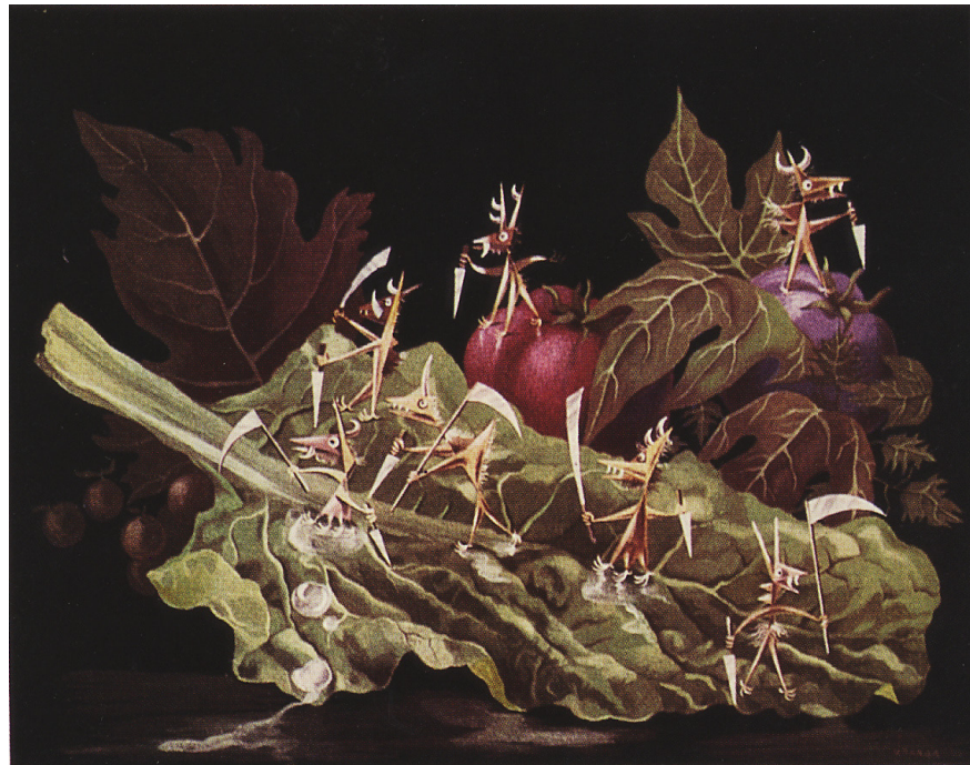
Fig. 3. Remedios Varo, Amebiasis , ca. 1948-49 © 2011 Artists Rights Society (ARS), New York / VEGAP, Madrid

Another illustration, titled Amebiasis , (ca. 1948-49, Fig. 3), was to serve as a pamphlet advertising medication for the prevention of intestinal parasites. In it Varo depicts a vegetal still life invaded by an army of machete-wielding microbes with large fangs and stick-like limbs. The contrast between the traditional naturalism of the still life and the comical army of tiny parasites conveys a surreal disjunction,