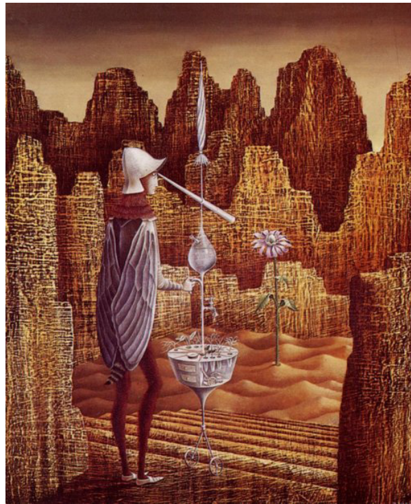
Fig. 4. Remedios Varo, Discovery of a Mutant Geologist , 1961 © 2011 Artists Rights Society (ARS), New York / VEGAP, Madrid

to insect and animal form, but also from geologist to botanist, as the scientist's work involves the study and propagation of plant forms as well as rock formations. Varo's scientist is thus cast as an intrepid explorer in pursuit of new life forms. In striking ways Varo's painting is also reminiscent of the many post-apocalyptic landscapes executed by Max Ernst during the war, and that also utilize decalcomania to eerily evoke the theme of civilization's ruin and decay. And yet Varo's image is clearly much less ominous, imparting, instead, the natural world's capacity for metamorphosis and self-renewal. Although Varo's painting alludes to the disastrous effects of scientific experimentation, recalling the real and hideous effects of atomic warfare, the quality of mutation itself, depicted through the ingenious adaptability and resourcefulness of the scientist, hints at the potential for science to redirect its energies toward more creative ends and the possibility of the earth's salvation. 31 It also hints at the seemingly adaptive nature of living organisms in the face of mankind's destructive drives. The ambiguity of this image in casting science as both destructive and