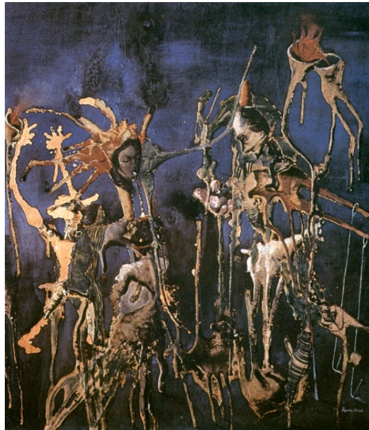
Fig. 1. Remedios Varo, Vegetal Puppets , 1938 © 2011 Artists Rights Society (ARS), New York / VEGAP, Madrid

The Surrealists' absorbed interest in the work of Gaston Bachelard was responsible for much of the movement's engagement with the new science. Bachelard fostered a lasting kinship between Surrealism and the stream of new ideas that transformed the scientific world in the 1930s. Often referred to as the "philosopher of Surrealism," Bachelard's The New Scientific Spirit (1934) was widely read and discussed by many of the Surrealists close to Breton. 13 Bachelard's The Formation of the Scientific Mind , which followed in 1938, was reviewed by Pierre Mabille. Trained in physics but also a keen reader of psychoanalysis, Bachelard drew