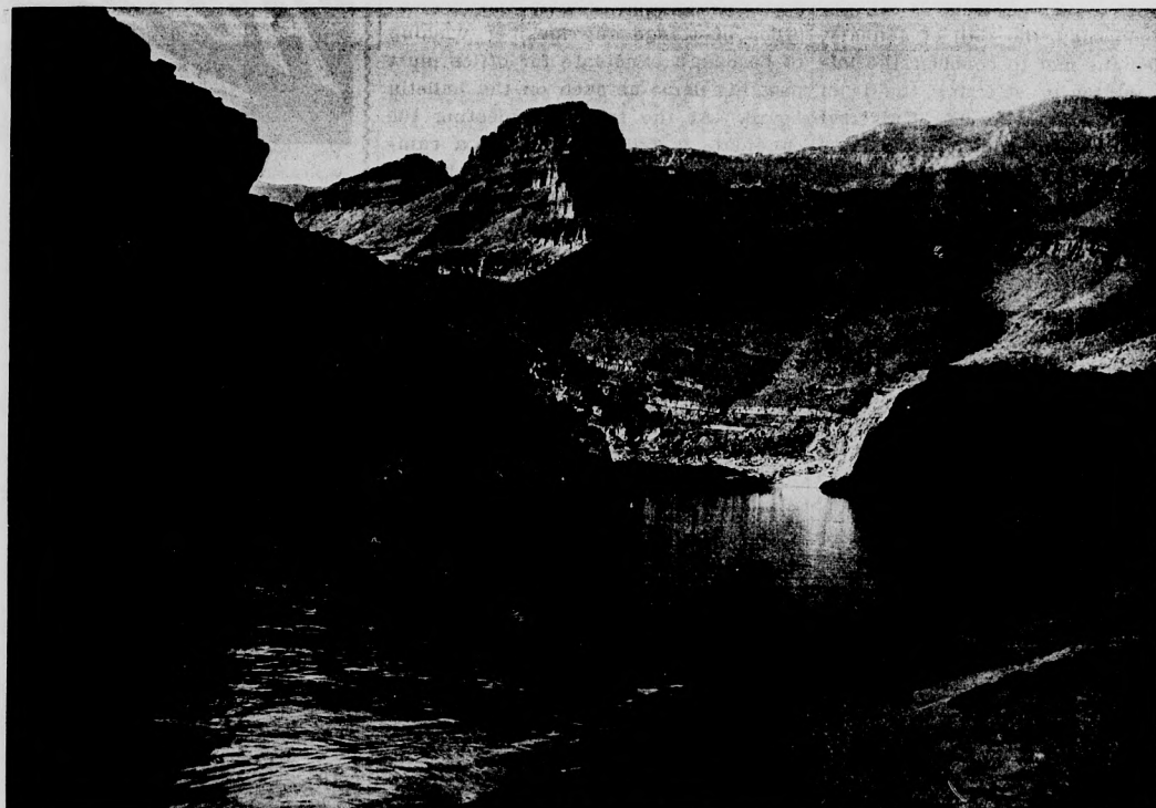
Grand Canyon of Arizona

After passing through the petrified forest, with its wonderful trees, we came to the Grand Canyon, impressive in its grandeur and massiveness. The