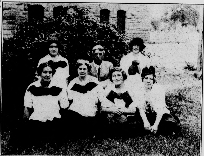
Basket Ball Team, '13-'14