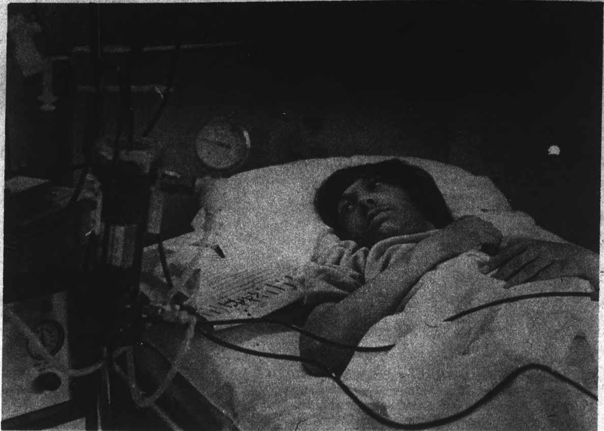
Man and machine