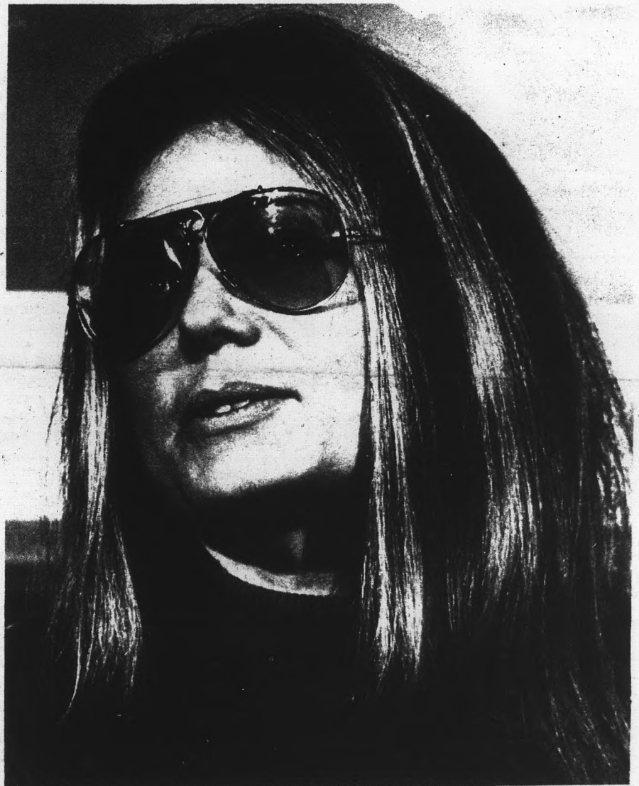
Ms. Gloria Steinem

She said the current editor of McCall's magazine is quitting to become the editor and publisher of Ms. "She's giving up an enormous salary and stock options (with McCall's). I think it shows something about where women in magazines are going."