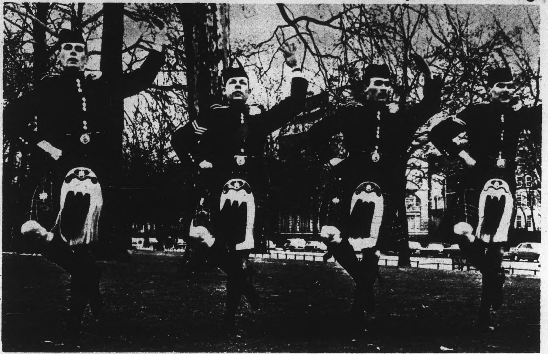
Her Majesty's very own Scots Guards will unleash rowdy Highland Flings, wailing

Tickets are on sale at the Music Theatre box office, 965-3398.