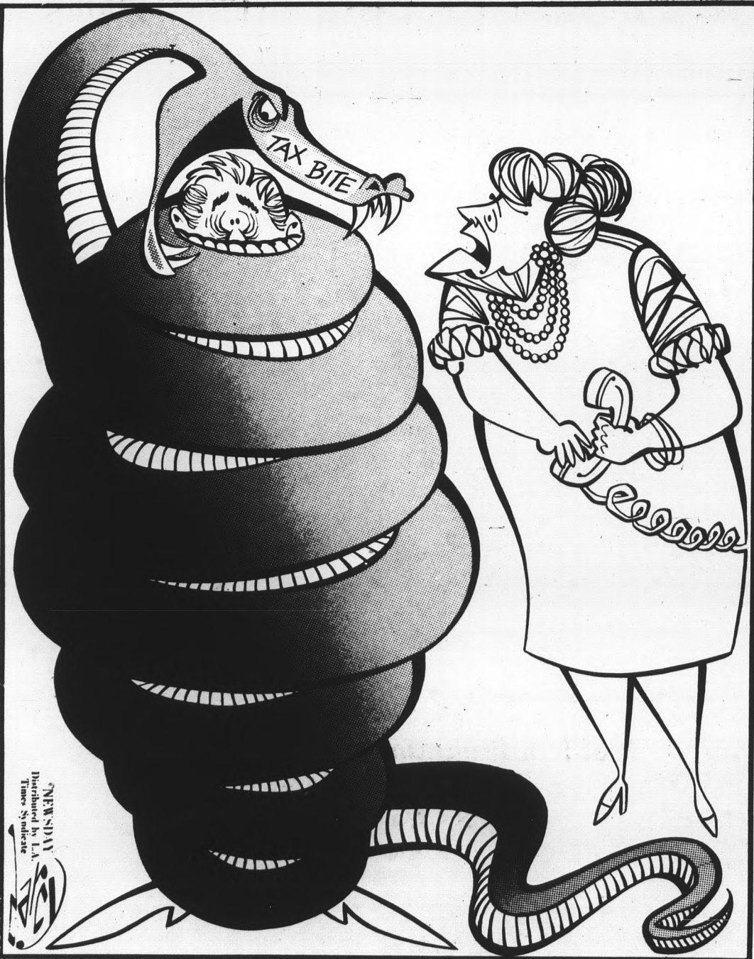
"More bad news, dear . . . pet store says snake food went up from $3 to $35.99 a pound!"

It would be unfortunate, however, if decreasing sales and increasing apathy put an end to this student publication.