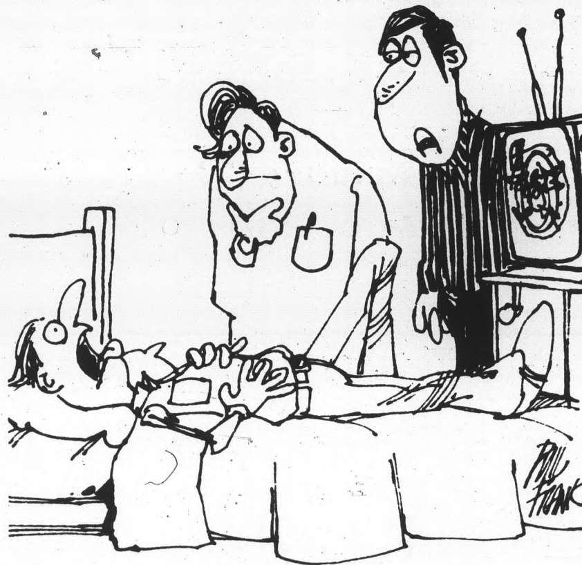
'HE'S JUST HAVING WITHDRAWAL PAINS AFTER THE PRESIDENT'S NEWS CONFERENCE!'