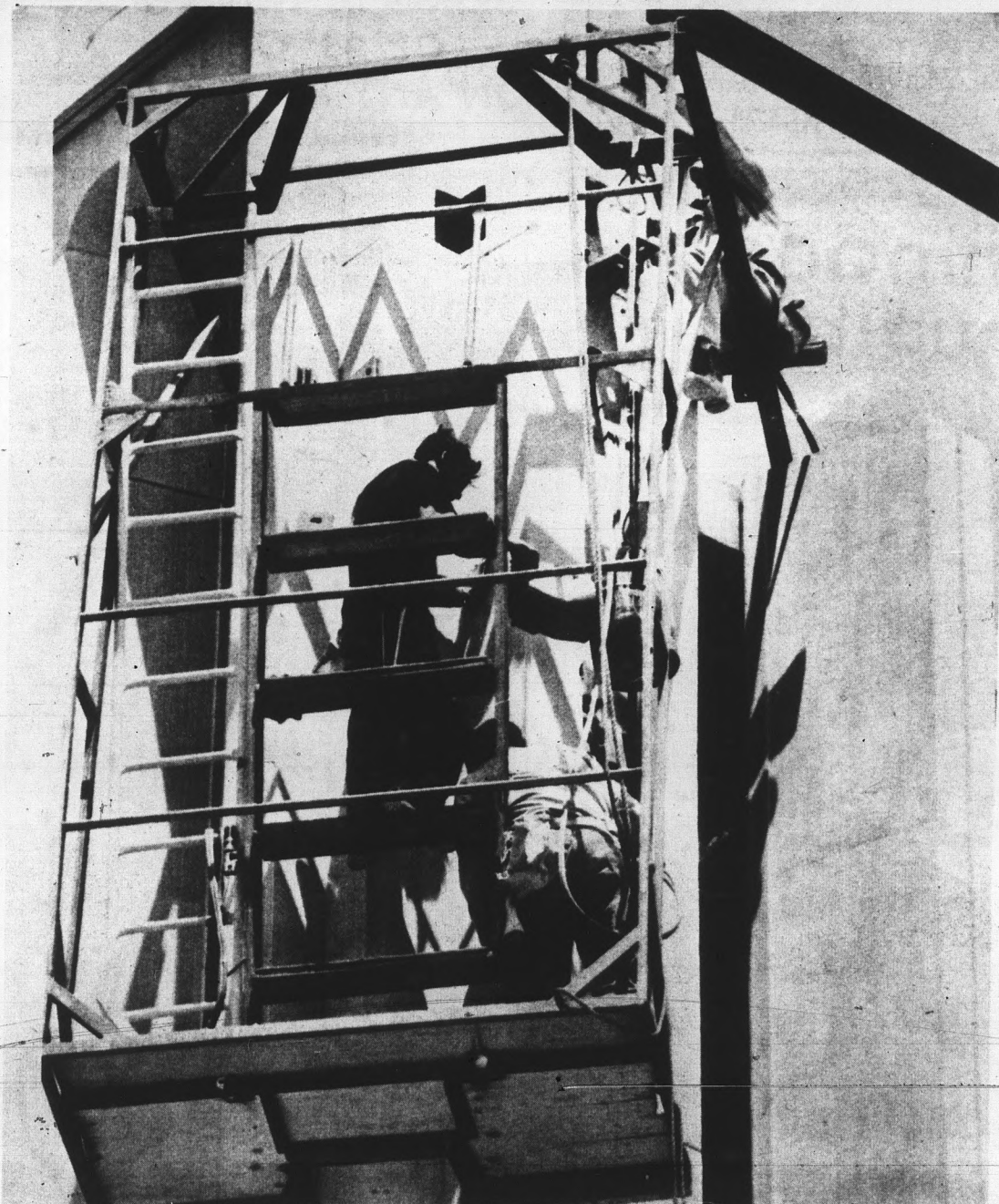
The men on the scaffolds speak

"We haven't finalized the (Continued on page 2)