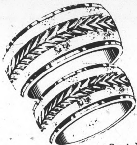
Sculptured laurel-leaf motif $39. each

Diamond or Sculptured Duos in 14-karat gold