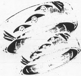
3 diamonds in each band $87.50 each

CHARGE IT... even if you've never had credit before!