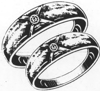
1 diamond in each band $69. each