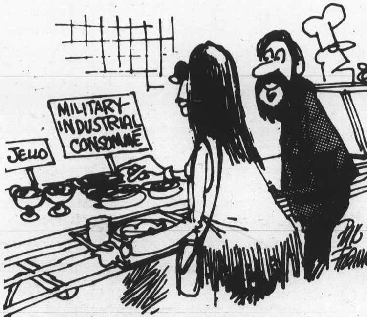
IT'S GOOD TO SEE THAT THE CAFETERIA IS DOING SOMETHING RELEVANT!

It's "1984" philosophy — war brings peace — but an uncomfortable fact in this case.