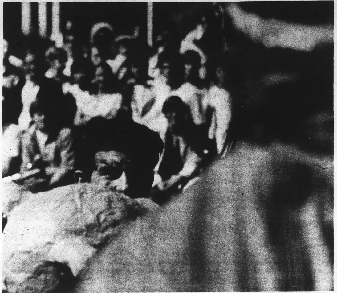
'KING CODE' Guerrilla Theaters, mime and satire troupe, enacted "King Code" last Friday in front of Hayden Library.