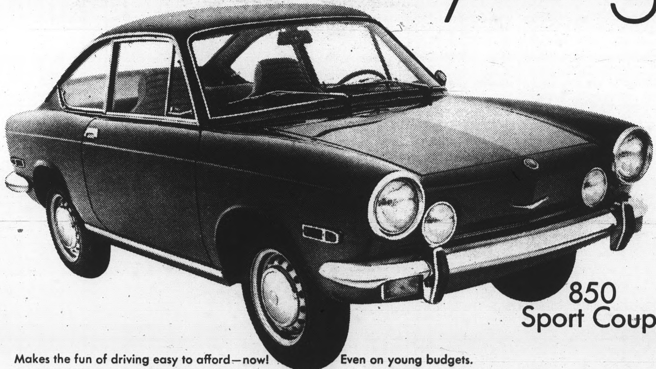
850 Sport Coupe

Makes the fun of driving easy to afford—now! Even on young budgets.