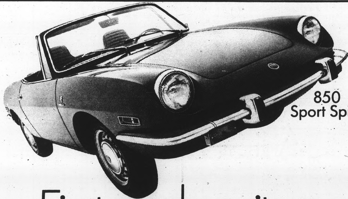
850 Sport Spider