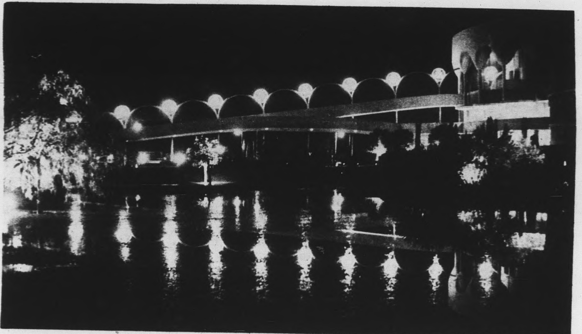
GAMMAGE AT NIGHT — Gammage Auditorium is reflected by irrigation water in one of the prettier campus sights at night.

Perhaps, though, because French slums are old and "quaint," they are less depressing to look at than American ghettos and easier to ignore, he said.