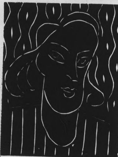
Woodcut By Henri Matisse