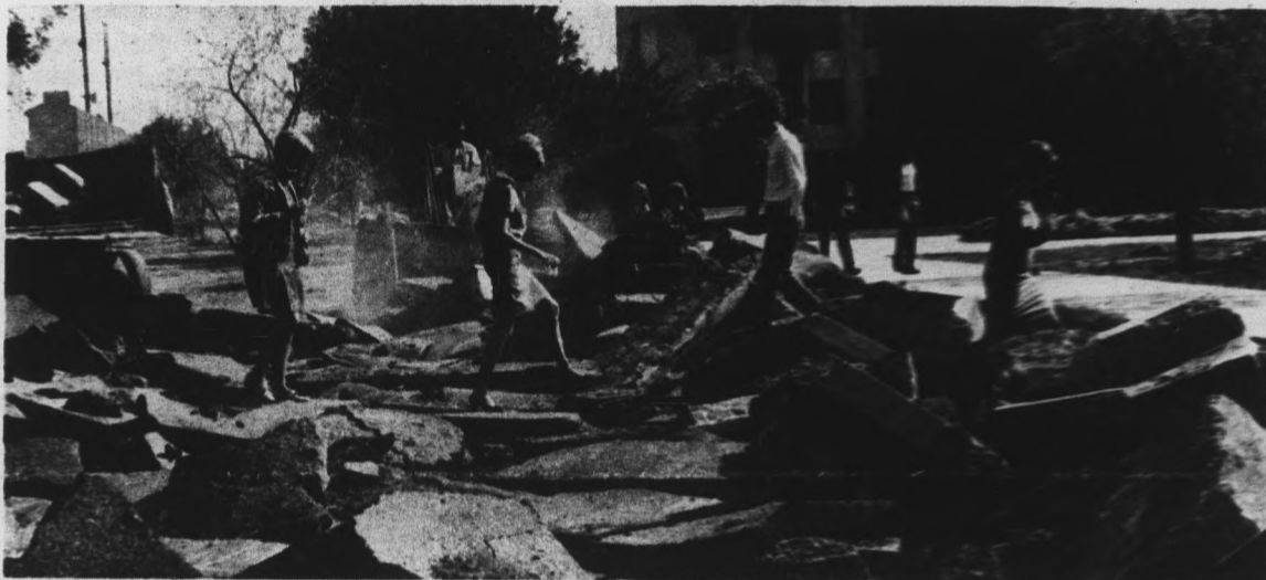
ROAD GETS ROUGHER — Summer students scale chunks of broken pavement and dodge bulldozers on their way to classes. The new Mall will be completed by fall.

THE MAIN ATTRACTION of the new Mall will be a tumbling water fountain, larger than that of old Main, and designed somewhat like the Gammage fountains, said Ellingson, although it will achieve a waterfall effect, rather than a spray.