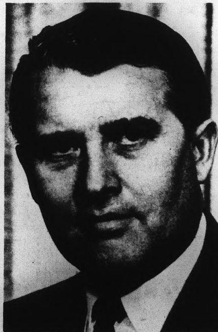
DR. WERNHER von BRAUN

The Marshall Center, employing about 7,000, is in charge of developing NASA's large launch vehicles and conducting re-