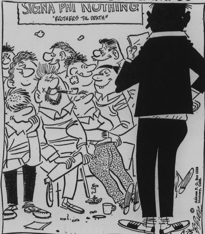
"AS CHAIRMAN OF OUR HIGHER ACADEMIC STANDARDS COMMITTEE, I CONCLUDE THERE IS ONLY ONE WAY WE CAN RAISE TH' HOUSE GRADE AVERAGE — CHEAT."