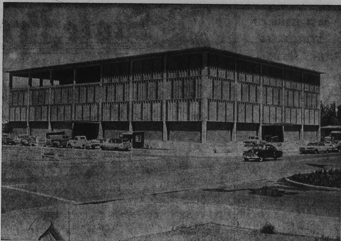
The new Education building now under construction has progressed along with the first summer session at ASU. It is estimated that it will be completed by Oct. 15, and open for classes beginning on Dec. 1.