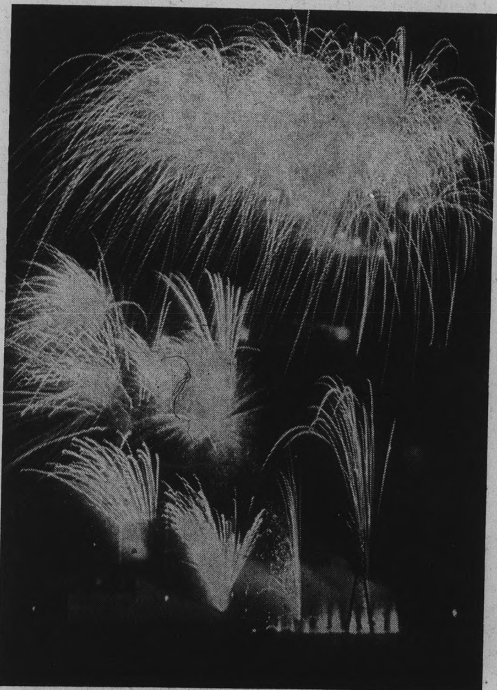
Pictured above is the "grand finale" at ASU's Sun Devil Stadium of the Tempe Kiwanis Club's July 4th celebration of Independence Day.

Those not registered in the current session should pick up these materials on July 17.