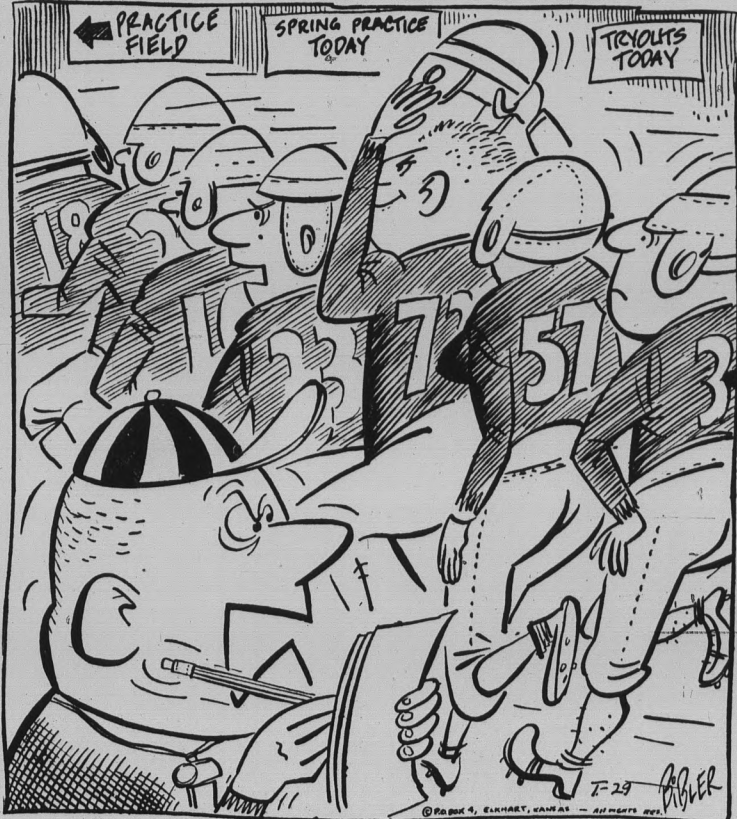
"JUST A MINUTE THERE 51!"