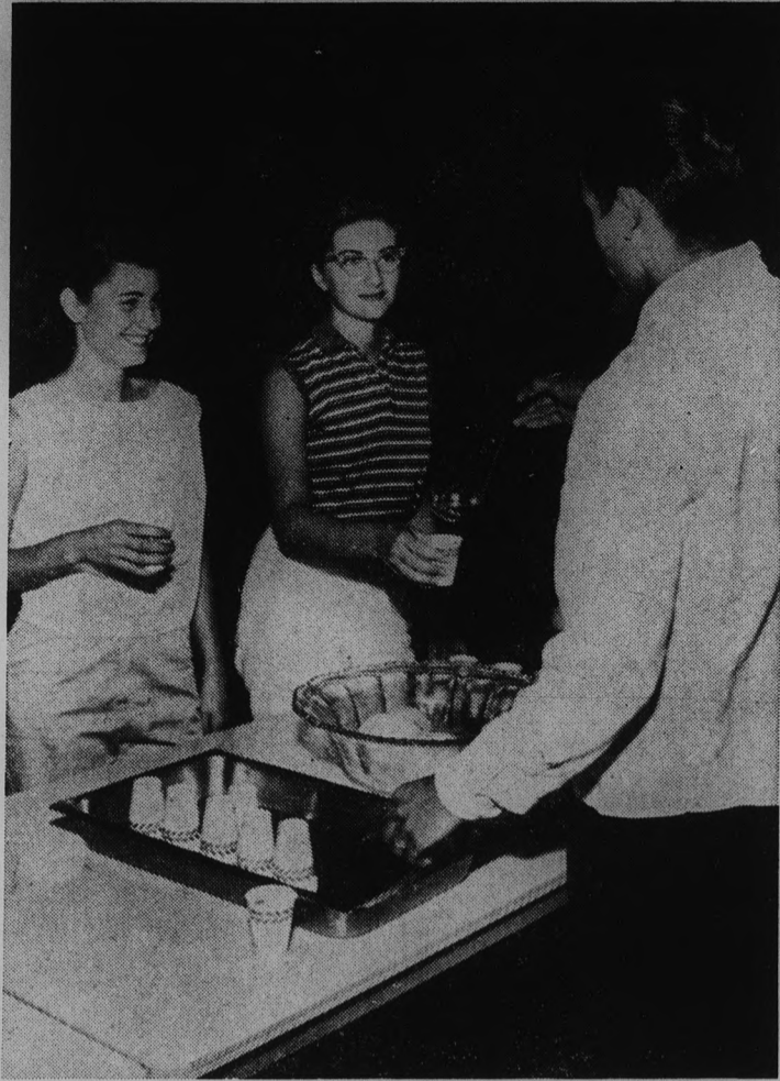
REFRESHING . . . Pause from registration was provided at the lemonade table Monday in the Memorial Union.

Subject of the talk will be the Menninger School of Psychiatry, at Topeka, Kans. Tickets are 90 cents at the MU information desk. Reservations close at noon Tuesday.