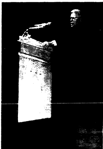
Helmut Schmidt, former Chancellor of West Germany

But "during the second half of the '70s, both superpowers have lost much of their mutual confidence in the calculability of the behavior of the other side," said Schmidt.