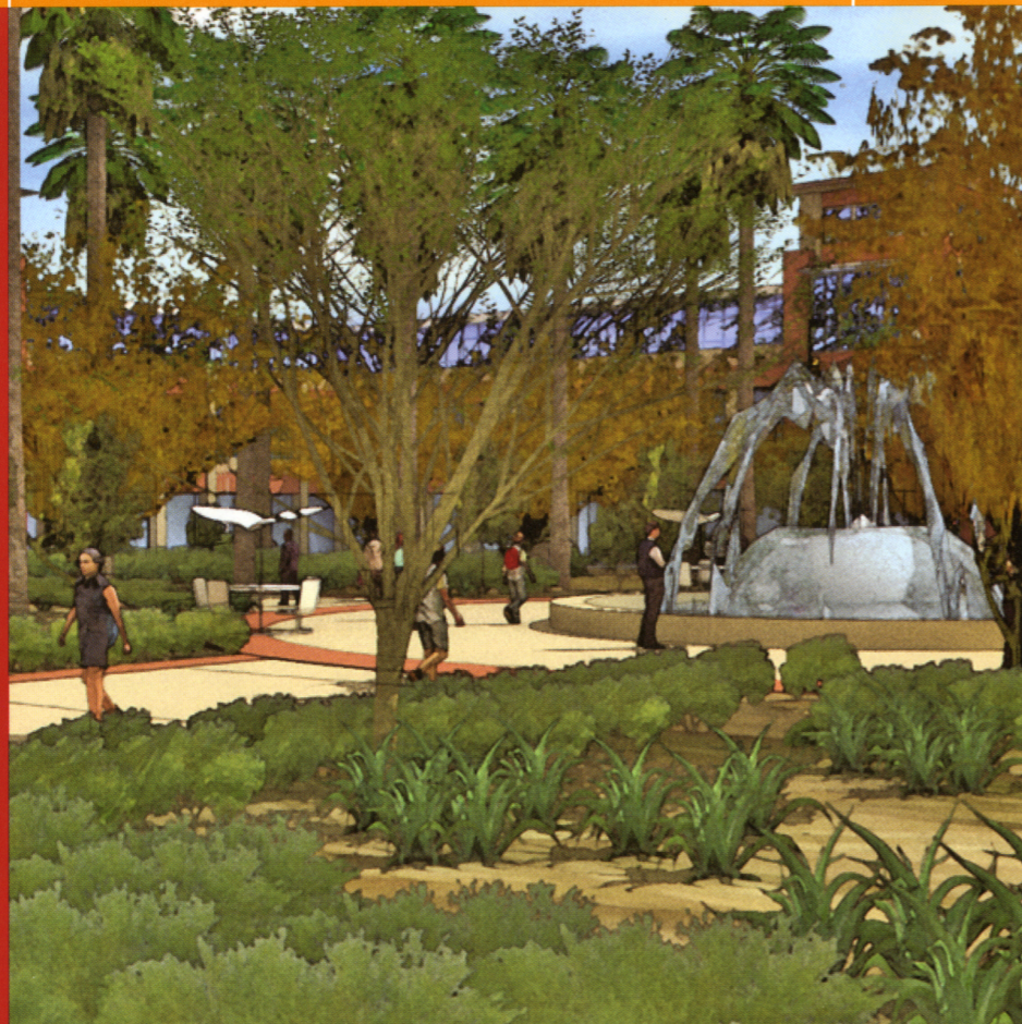
ASU at the West campus town square.

A comprehensive campus that balances the traditions of liberal arts education with responsiveness to the dynamics of workforce requirements, ASU at the West campus is committed to teaching and research that are innovative, interdisciplinary, collaborative, and problem-based. The West campus offers students a rich learning environment focused on undergraduate and graduate academic programs in four colleges and schools, and has been the recipient of national recognition for its community service. Through partnerships with local not-for-profits, governmental agencies, and industry groups, West campus students learn by working on problems that focus on societal and community issues. The campus recently observed its twentieth anniversary and serves a diverse body of more than 7,000 students, with capacity to more than double that enrollment.