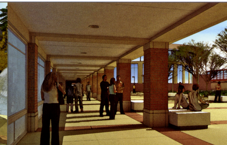
New Library courtyard.