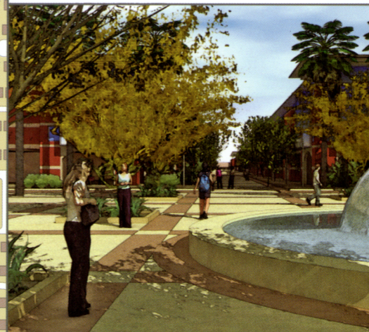
The extended mall connects housing to campus core.