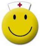
HAPPY NURSES' DAY

On May 6, 2012 the Native American Nurses Association (NANA) sponsored a luncheon for nurses at Macayos depot cantina in Tempe. The luncheon is an annual event sponsored by NANA during National Nurse Week. The luncheon was a success due to generous donations.