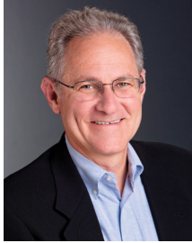
HONORABLE JONATHAN ROTHSCHILD Mayor