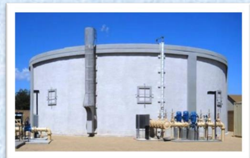
Brisas Well Site

The City of El Mirage conducts extensive monitoring to guard against contaminants in the drinking water according to federal and state laws. The state of Arizona requires monitoring for certain contaminants less than once per year because the concentrations of these contaminants are not expected to vary significantly from year to year, or the system is not considered vulnerable to this type of contamination. All detected contaminants were below the maximum contaminant level in the drinking water. There were no violations. This ensures that the quality of the drinking water for El Mirage is safe and poses no health risks.