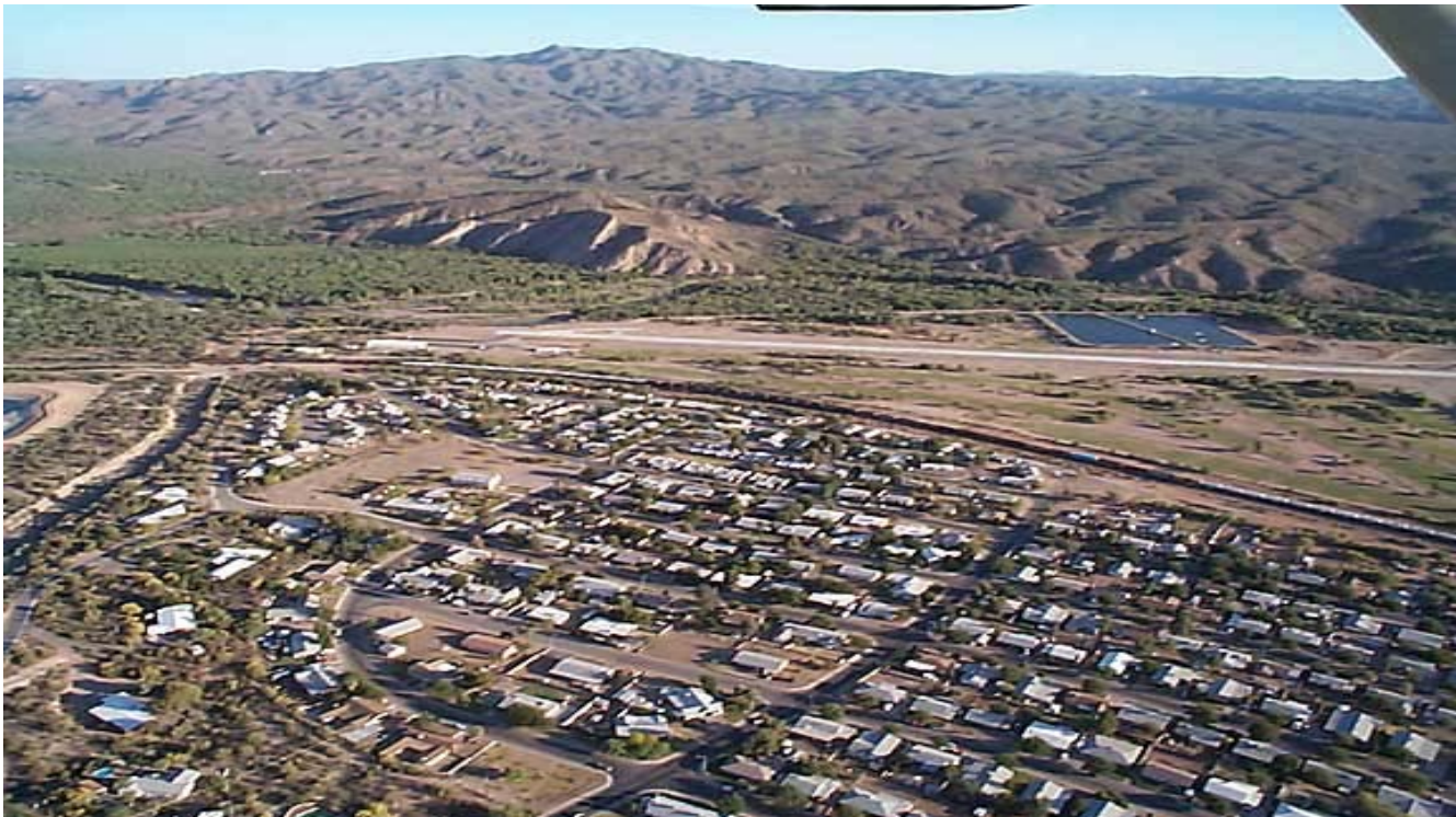
Kearny Airport Airport of the Year-2003