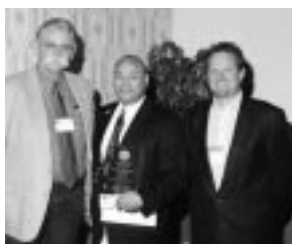
Allstate Insurance Company, 2002 Outstanding Private Sector Partner of the Year.