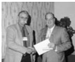
Arizona Department of Transportation - Motor Vehicle Division, 2002 Outstanding Government Partnership of the Year.