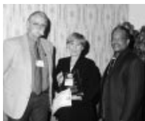
Phoenix Police Department's Valley H.E.A.T. Project, 2002 Special Law Enforcement Project of the Year.