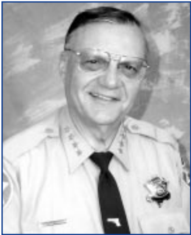
Sheriff Joseph Arpaio Maricopa County Sheriff

The Arizona Automobile Theft Authority is pleased to announce that the Arizona Sheriffs Association appointed Sheriff Joseph Arpaio to the AATA Board of Directors in February 2003. Sheriff Arpaio occupies the second Sheriff position on the AATA Board, representing a county with a population of five hundred thousand or more persons.