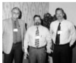
Tucson Police Department/Pima County Task Force, 2002 Law Enforcement Unit of the Year.