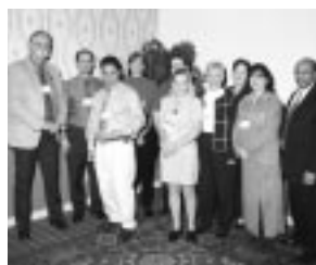
Mesa Police Department's Crime Prevention Unit, 2002 Public Awareness and Community Education Unit of the Year.