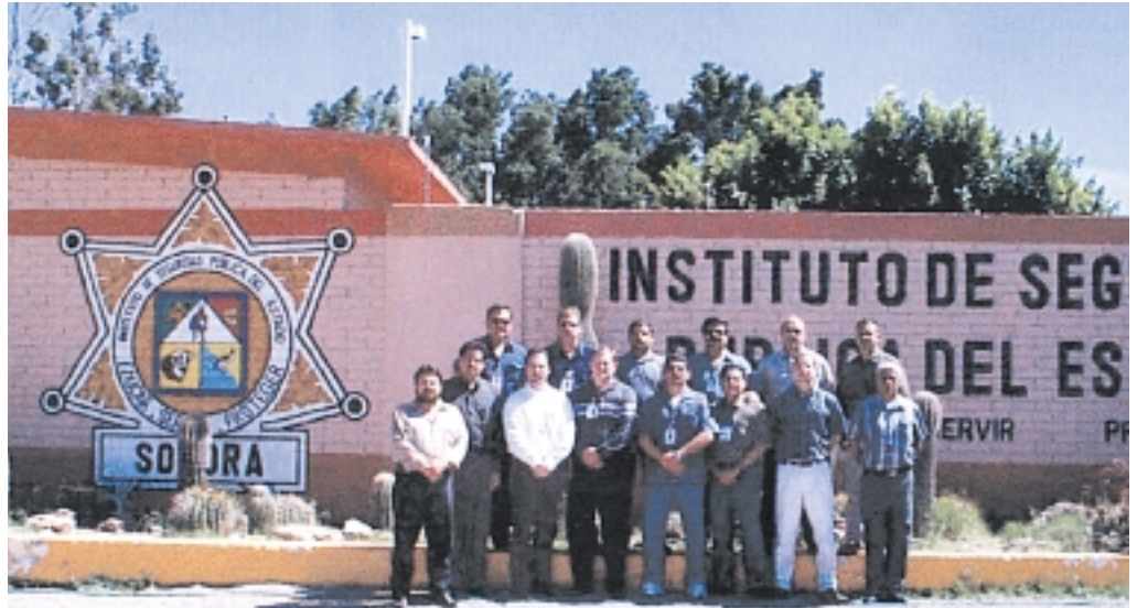
Arizona and Mexico delegation at the Sonora State Police Academy in Hermosillo, Mexico on March 8, 2002.

The purpose of the meetings was to establish and foster professional and cooperative partnerships in the area of vehicle theft enforcement and investigation in both countries. The AATA's partnership with DPS on the development of a Border Auto Theft Information Center (BATIC) was announced along with discussions of