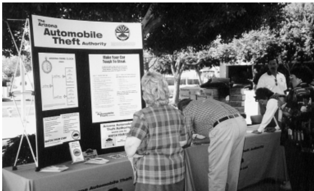
Event participants attend AATA/DPS Auto Theft Prevention event on March 6, 2002.

The decal will aid in the public's and patrol officer's on-going awareness of this valuable program.