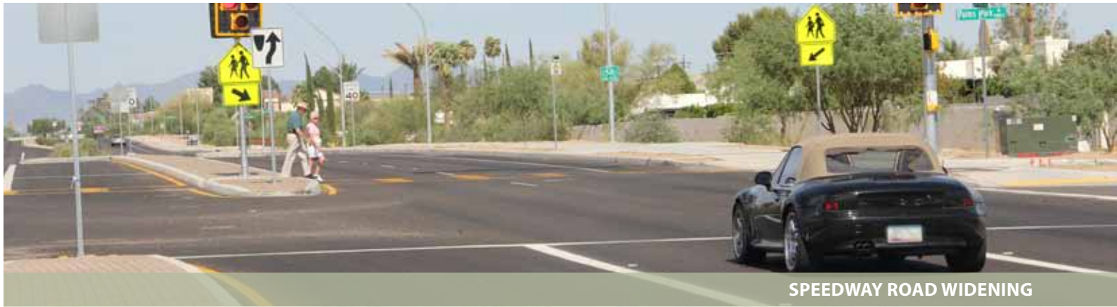
SPEEDWAY ROAD WIDENING