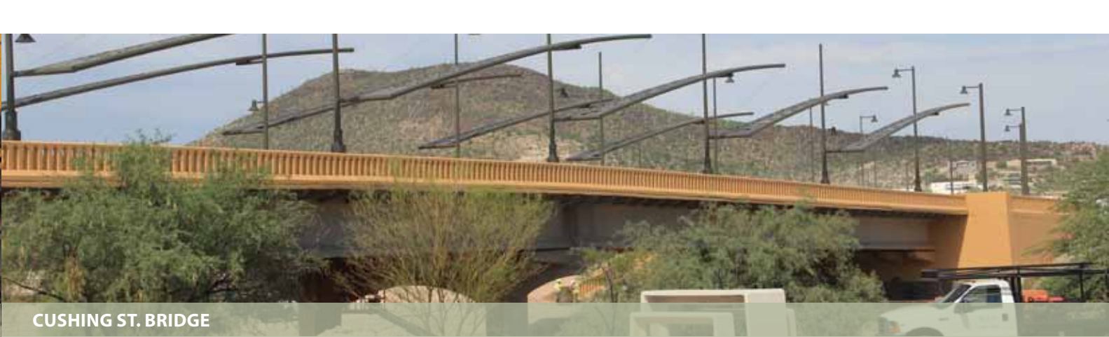
CUSHING ST. BRIDGE