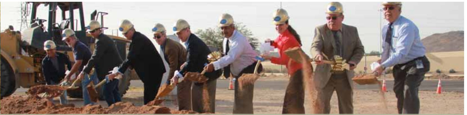
DOWNTOWN LINKS GROUNDBREAKING