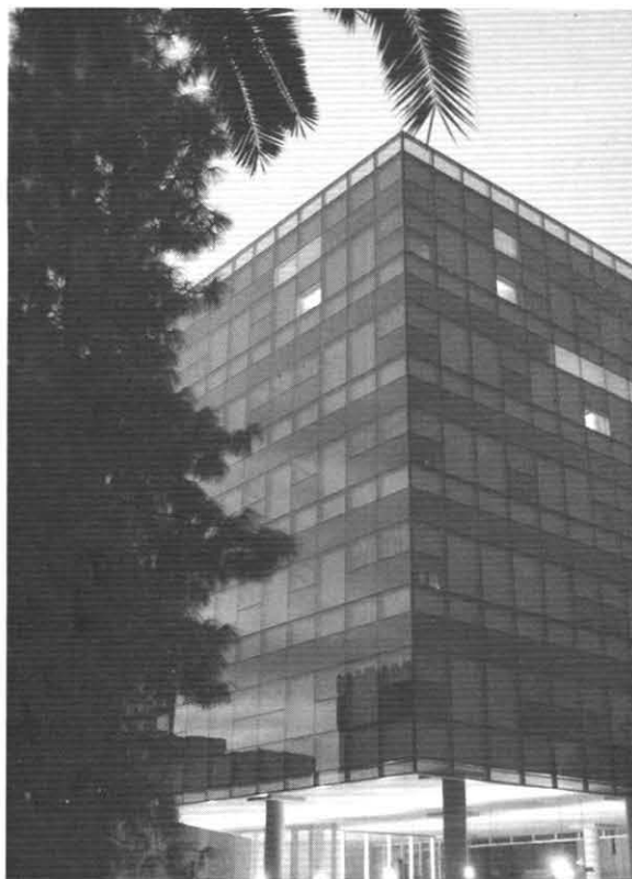
ASU's newest building, Lattie F. Coor Hall, was dedicated in January 2004. Named in honor of ASU's 15th president, the facility is the largest building on campus, housing 25 state-of-the-art mediated classrooms.