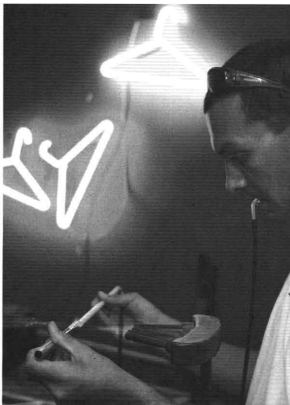
The Katherine K. Herberger College of Fine Arts offers one of the few college-based neon sculpture programs in the country.

Reinstatement. Students seeking reinstatement after disqualification should contact the Katherine K. Herberger College of Fine Arts Student Services Office regarding procedures and guidance for returning to good standing. When reinstatement includes readmission, application must be made to the Readmissions Section of the Office of the Registrar.