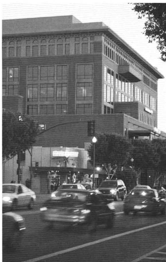
Mill Avenue, a short walk from campus, offers students a break from studies with restaurants, movie theatres, and unique shops. The Brickyard building is home to many of the Ira. A. Fulton School of Engineering offices.