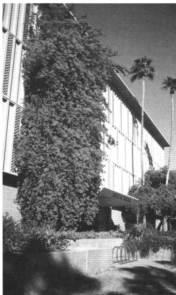
Named after Hiram Bradford Farmer, the first principal of what is now ASU, Farmer Education Building houses classrooms, offices, and a child care center.