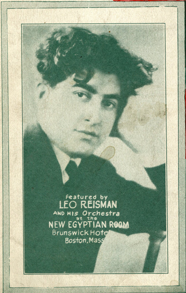
Featured by LEO REISMAN AND HIS ORCHESTRA at the NEW EGYPTIAN ROOM Brunswick Hotel Boston, Mass.