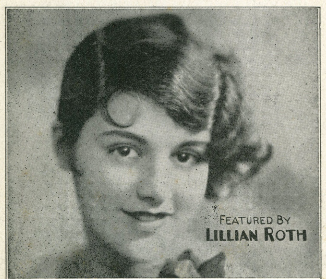
FEATURED BY LILLIAN ROTH

Words by GUS KAHN Music by WALTER DONALDSON