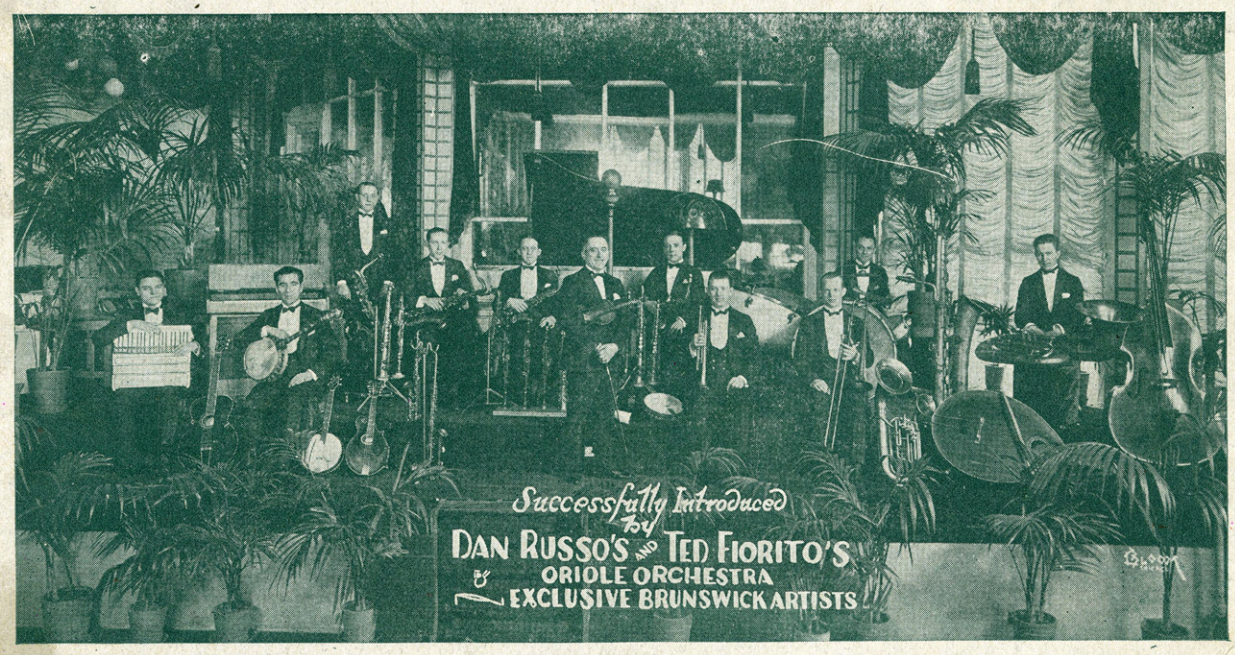
Successfully Introduced by DAN RUSSO'S AND TED FIORITO'S ORIOLE ORCHESTRA EXCLUSIVE BRUNSWICK ARTISTS