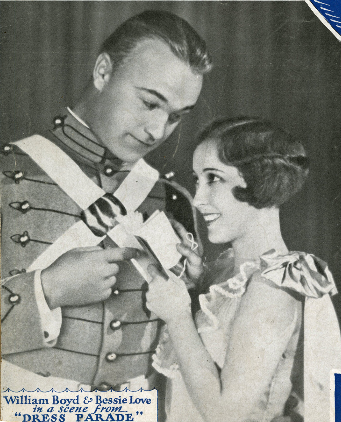
William Boyd & Bessie Love in a scene from "DRESS PARADE"