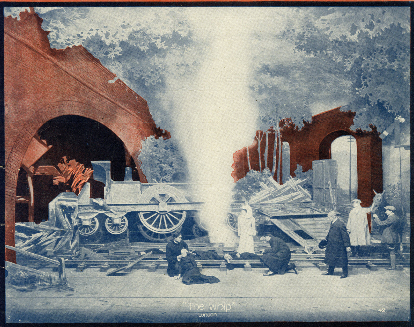
"The Whip" London