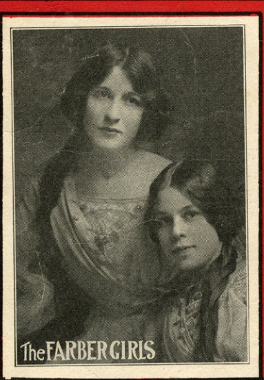
The FARBER GIRLS

ORIGINALLY INTRODUCED BY THE FARBER GIRLS IN VAUDEVILLE