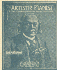
VLADIMIR DE PACHMANN