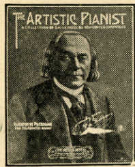
VLADIMIR DE PACHMANN