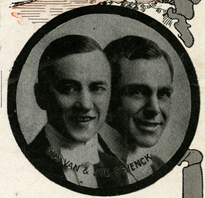
GUS VAN & JOE SCHENCK

ON SALE AT EVERY MUSIC COUNTER—ASK THE PIANIST TO PLAY THEM