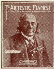
VLADIMIR DE PACHMANN