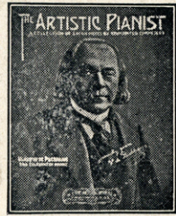
VLADIMIR DE PACHMANN