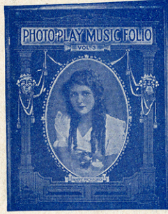
Photo-Play Music Folio Each volume contains a large variety of Photo-Play Music for almost any occasion and the pieces are arranged in such a way that they may be repeated as often as desired. Volumes 1, 2 and 3 now ready Vol. 1 contains colored Photograph of John Bunny Vol. 2 contains colored Photograph of Lillian Walker Vol. 3 contains colored Photograph of Mary Pickford.

Famous Selections FROM Famous Operas FOR PIANO Arranged in Medium Grade The characters of the Opera, together with a brief synopsis of the Libretto, date and place of first Performance, Birth, and Death Year of Composer and other Important Items are also included in these volumes. CONTENTS Vol. I. Selections From "Carmen" by Bizet "Faust" by Gounod "Aida" by Verdi "Bohemian Girl" by Balfe Volumes 1, 2 and 3 now ready