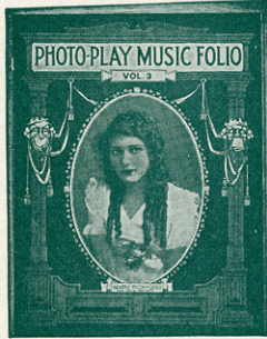
Photo-Play Music Folio

Arranged in Medium Grade The characters of the Opera, together with a brief synopsis of the Libretto, date and place of first Performance, Birth, and Death Year of Composer and other Important Items are also included in these volumes. CONTENTS Vol. I. Selections From "Carmen" by Bizet "Faust" by Gounod "Aida" by Verdi "Bohemian Girl" by Balfe Volumes 1, 2 and 3 now ready