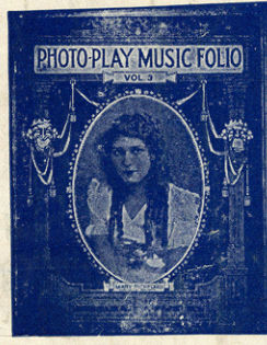
Photo-Play Music Folio

Arranged in Medium Grade The characters of the Opera, together with a brief synopsis of the Libretto, date and place of first Performance, Birth, and Death Year of Composer and other Important Items are also included in these volumes. CONTENTS Vol. I Selections From "Carmen" by Bizet "Faust" by Gounod "Aida" by Verdi "Bohemian Girl" by Balfe Volumes 1, 2 and 3 now ready