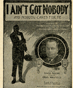
Most Popular "Blues" Song Ever Written