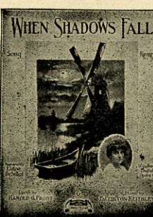
The Concert Ballad Success