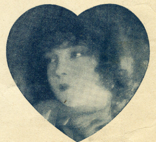
LILLIAN GISH

Published by LEE JOHNSON MUSIC PUBLISHING CO. LOS ANGELES, CAL. NEW YORK LONDON