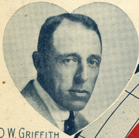
D.W. GRIFFITH