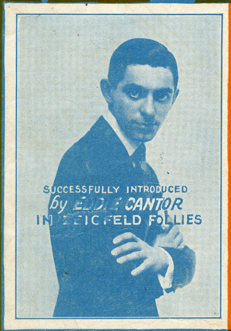
SUCCESSFULLY INTRODUCED by EDDIE CANTOR IN ZEIGFELD FOLLIES