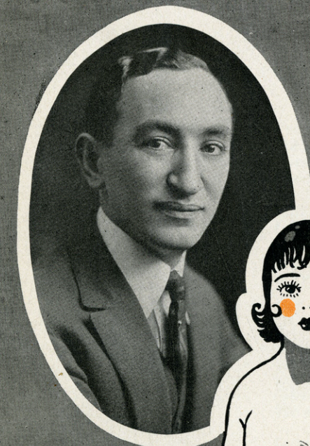
Featured by LEW COOPER