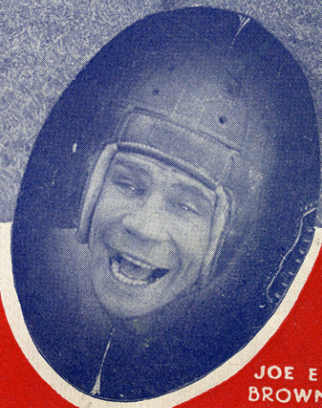
JOE E. BROWN