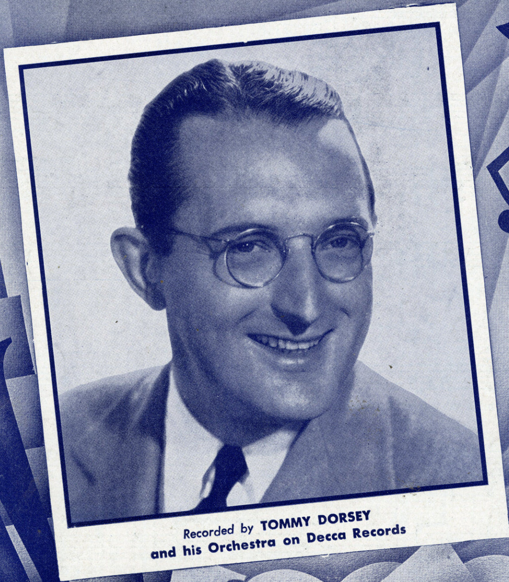
Recorded by TOMMY DORSEY and his Orchestra on Decca Records