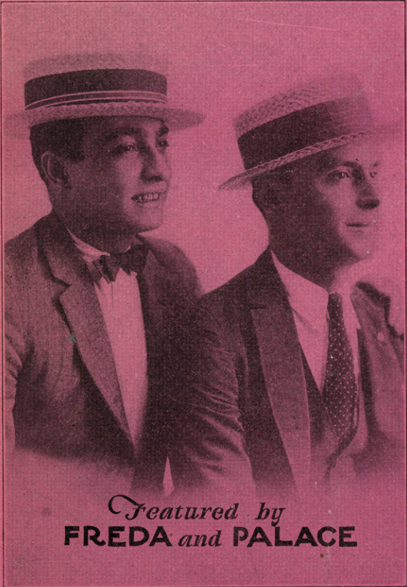
Featured by FREDA and PALACE